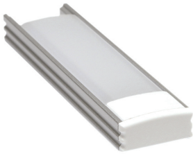
shown with closed end cap