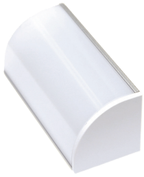
shown with closed end cap