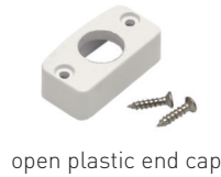
open plastic end cap