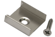
mounting clip & screw

At only a third of an inch high, the Surfa 5 is ideal for low-profile surface mounting of LED tape light. Surfa 5 can be configured for installation in wet locations using dry location LED tape light.