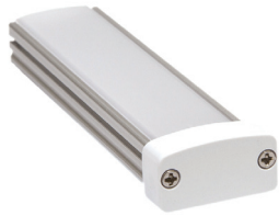
shown with closed end cap