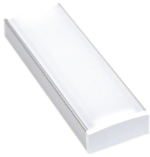
shown with closed end cap