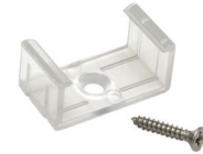
mounting clip & screw

The Surfa 6 is a wide but very low-profile channel to accommodate any Alloy LED tape light for any size installation. This model is ideal for areas that call for a discreet light fixture.