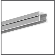
PDS-4-PLUS Extrusion Ref: C1263