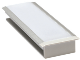
shown with closed end cap