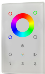
DMX Touch Wall Controller

AL-60-03-0003 Use with the Wireless Receiver (AL-60-03-0004 – sold separately)