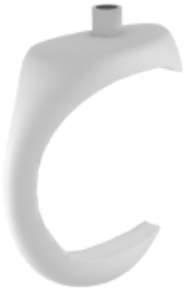
Ref. 69040 Suspension clip for K-NFR-1600-24V series