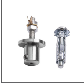
W-KG Fastener Ref: 1559