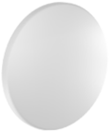
Ref. 69037 End cap for K-NFR-1600-24V series