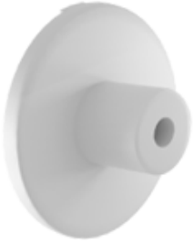
Ref. 69038 End cap with hole for K-NFR-1600-24V series