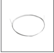
Stainless Steel Wire 39.4" (1m) Ref: 1397