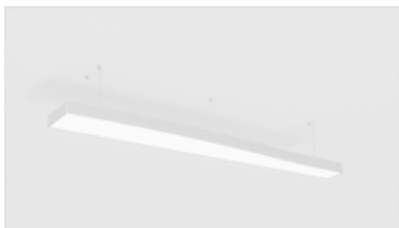
Module MI-WAVE-01 REF: 45022