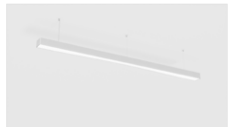
Module MI-WAVE-04 REF: 45025